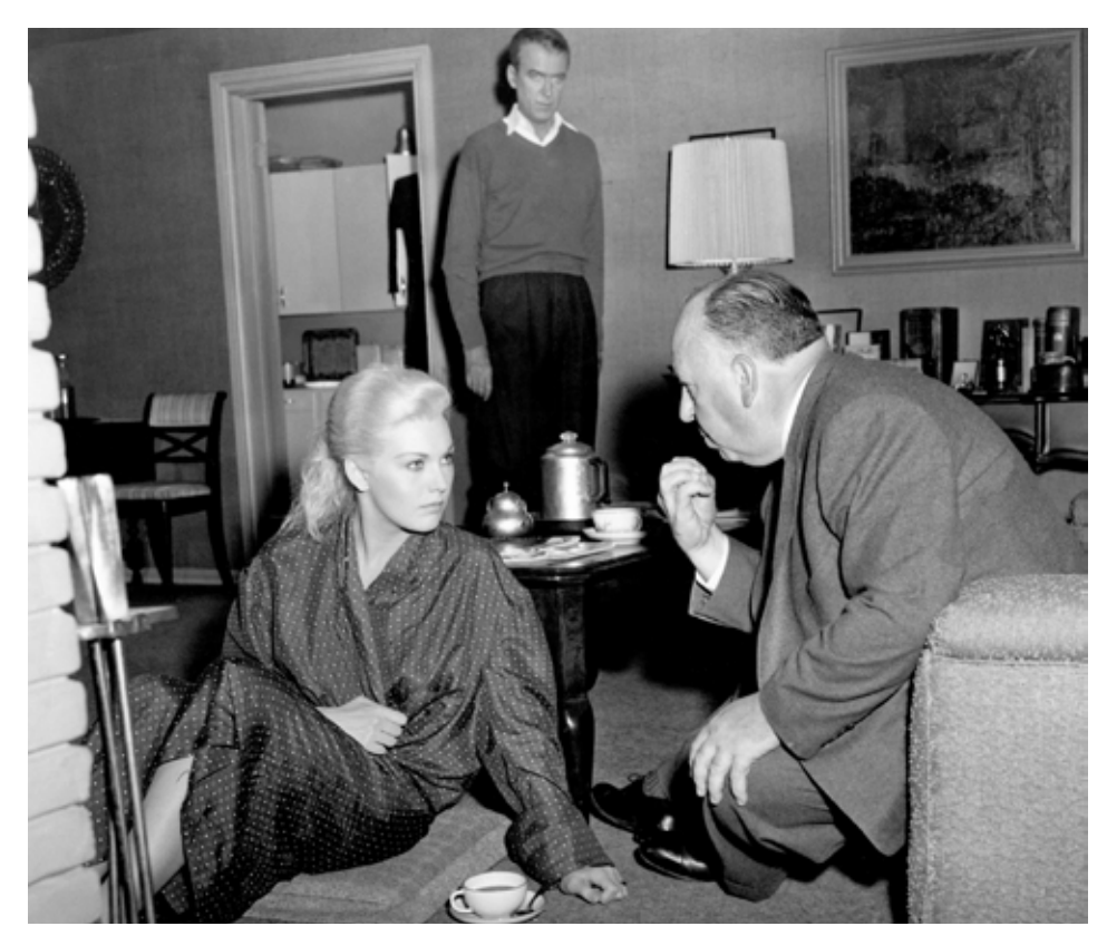
This scene in Scottie's apartment required over a week of shooting and endless retakes until Hitchcock was satisfied with the tone and pacing

dreaming in front of Pauline's tomb.... Homesick! For the grave! ... No, it was impossible. But who really knew what was possible or not?" Even the perfume she wears reminds Flavières of freshly dug earth, and the decay of withered flowers.