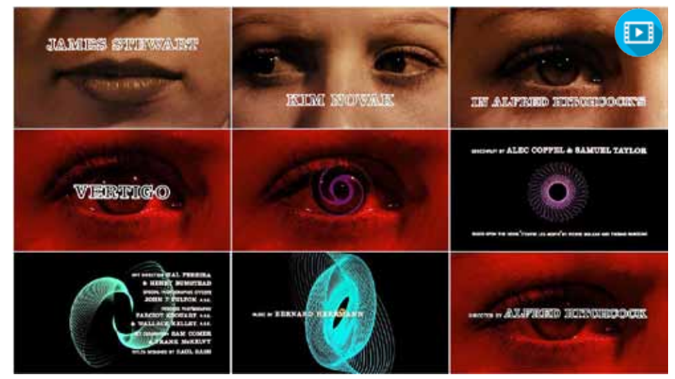
Vertigo's opening credit sequence by Saul Bass draws the viewer in through the "mind's eye"

was to extract the essence from the source material and weave his own distinctive story around it, making it very much his own (e.g.: Rear Window, Strangers on a Train, Psycho). But in this case, he followed the novel with unwavering fidelity. His imprimatur for this film-its visual texture-directly referenced silent movies, which he considered the purest form of cinema. "Dialogue should simply be...something that comes out of the mouths of people whose eyes tell the story in visual terms." He typically employed to great effect what he referred to as the "subjective treatment," an alternating pattern of shot/ reaction shot, which he used to heighten suspense. In Vertigo, this technique forms the principle structure of the narrative, intensifying our identification with Scottie's obsession, which ultimately leads to psychosis.